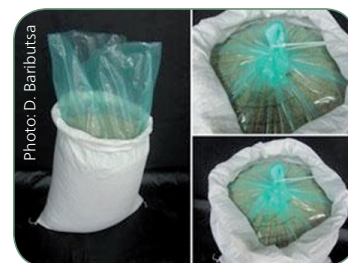
Figure 5: GrainPro sack