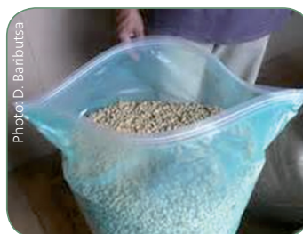
Figure 5: GrainPro sack