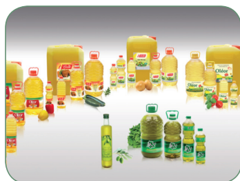
Figure 3: Locally available hermetic storage containers