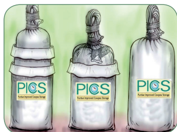
Figure 4: PICS sack